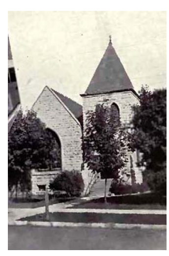
Historic photograph of church from NAPERVILLE 1917