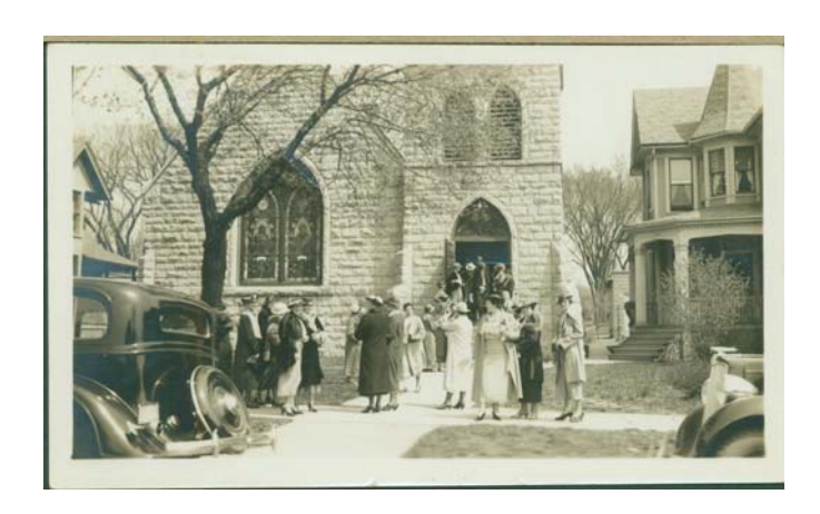
Historic photograph of church in collections of Naper Settlement Research Library and Archives