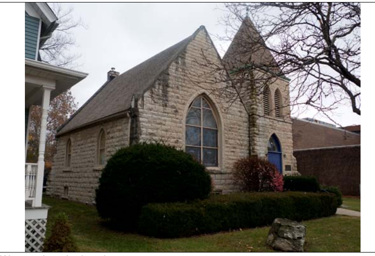
West and north elevations