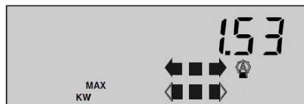
Demand measured in kilowatts (kW)

Demand is the rate at which energy is used and is measured in kilowatts (kW), which is a unit of power. To find your maximum 30-minute demand within the last 30 days, look for a number display accompanied by MAX kW. The max demand in the example below is 1.53 kW.