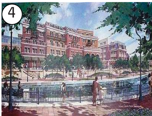
Water Street 79 Feet