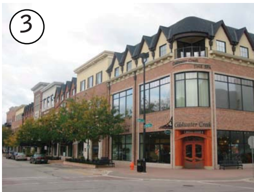
Main Street Promenade 59 Feet