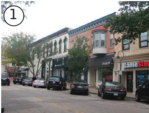
Jefferson & Main 20-30 Feet