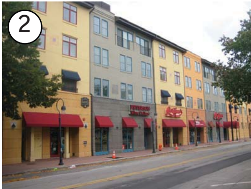
Naper Place 45 Feet