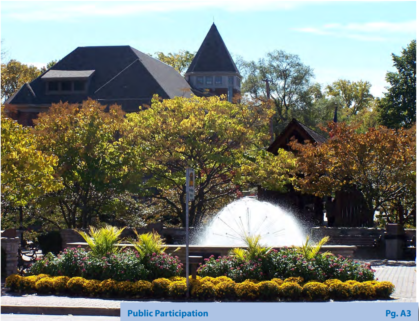
Naperville Riverwalk