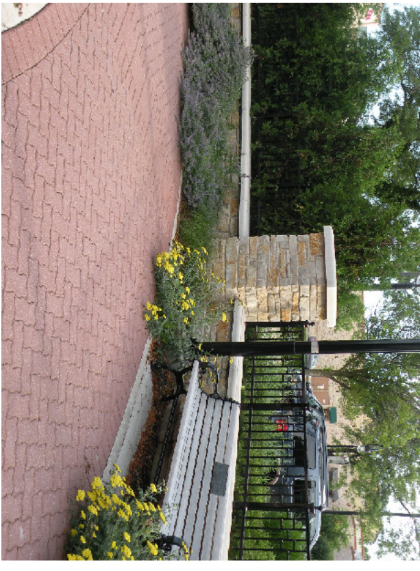
BENCH / WALL AND PIERS