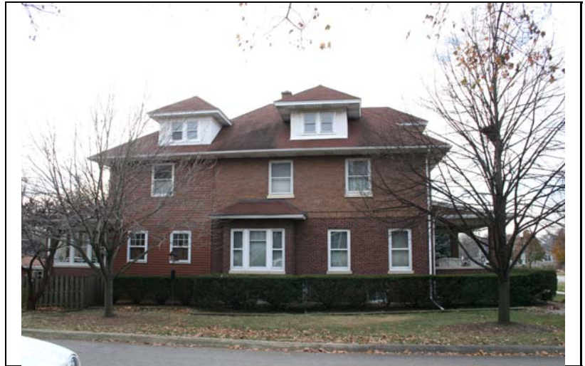
DIGITAL PHOTO ID