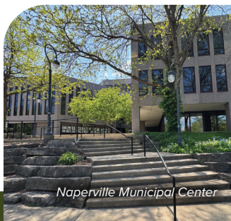
Naperville Municipal Center

This pavilion is located near the Dandelion Fountain and across the street from the Naperville Public Library. It was designed to allow individuals or organizations to express their ideas and/or distribute non-commercial written materials to the public. For more information, visit the Naperville Park District's Free Speech Activity Rental webpage at napervilleparks.org/freespeechactivityrentals .