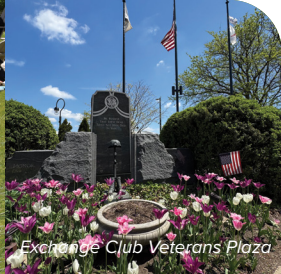
Exchange Club Veterans Plaza

Named for its shape, the Dandelion Fountain, located at Jackson Avenue and Webster Street, is surrounded by a picturesque scene of trees, foliage, flowers and the nearby covered bridge, making it a perfect place to enjoy lunch or some quiet time.