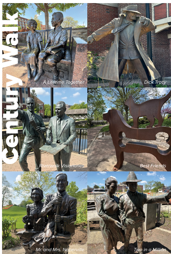
A Lifetime Together

For additional information regarding Naperville community resources, visit napervilleparks.org/communitypartners .