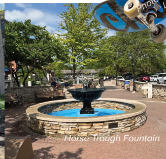
Horse Trough Fountain