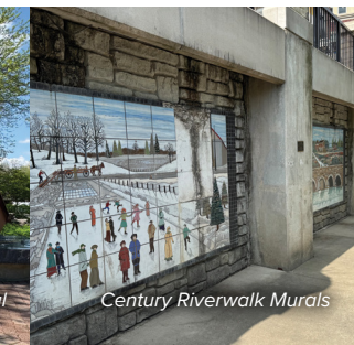
Century Riverwalk Murals