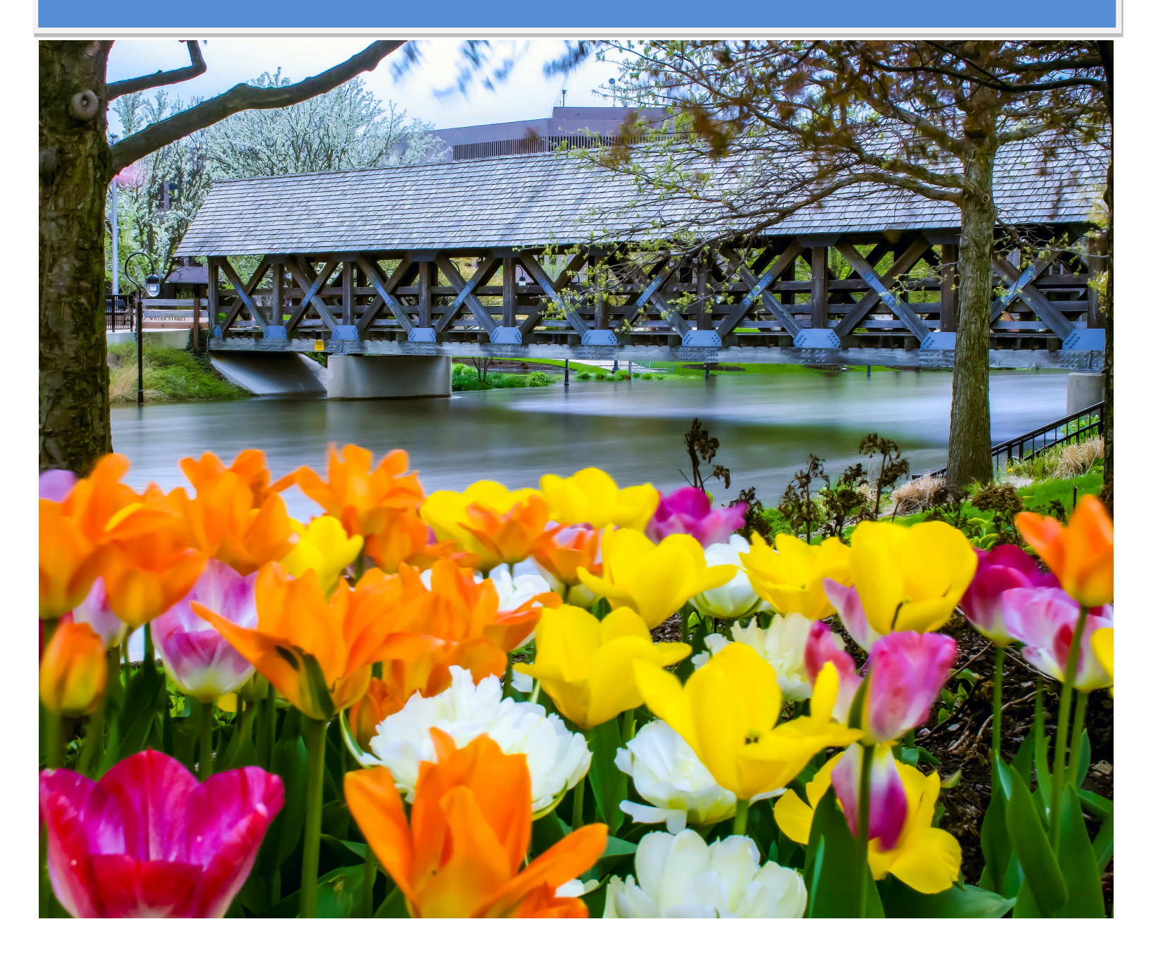
City of Naperville, Community Services Department, 400 S. Eagle Street, Naperville, IL 60540