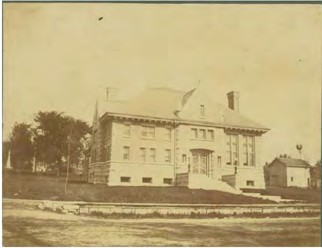
Historic photograph from collections of Naper Settlement Research Library and Archives