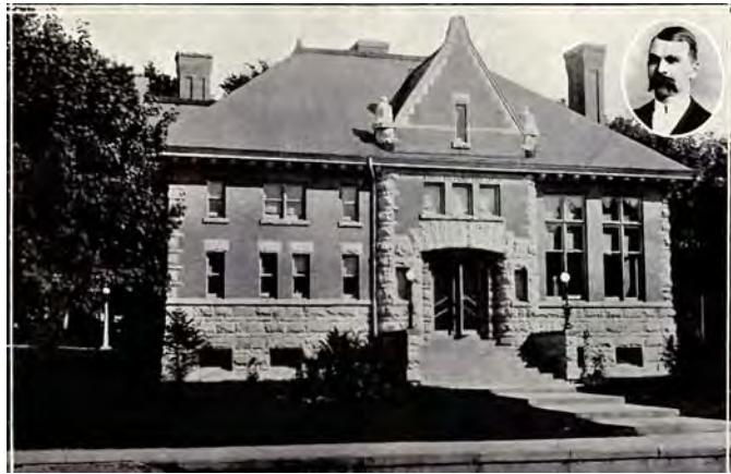
Historic photograph from NAPERVILLE 1917 (inset photo of James L. Nichols at upper right)