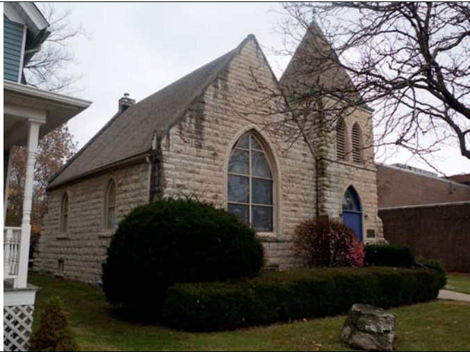
West and north elevations