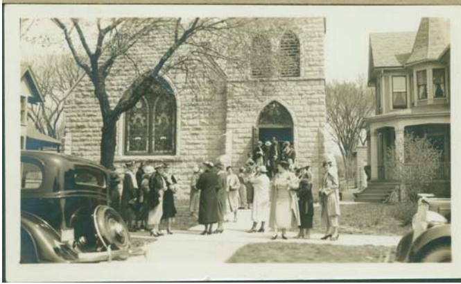
Historic photograph of church