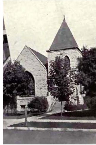
Historic photograph of church from NAPERVILLE 1917