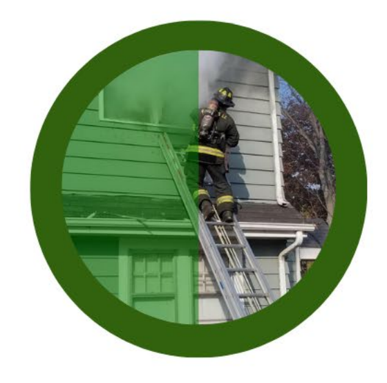
Explore new ways of service delivery while adapting to changing community needs