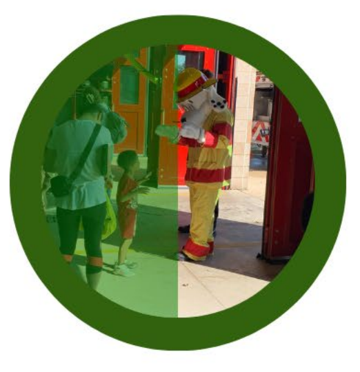
Promote and foster community risk reduction