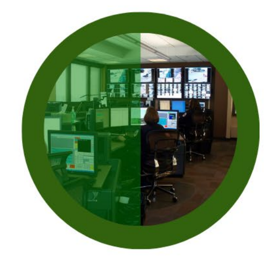
Implement technological enhancements