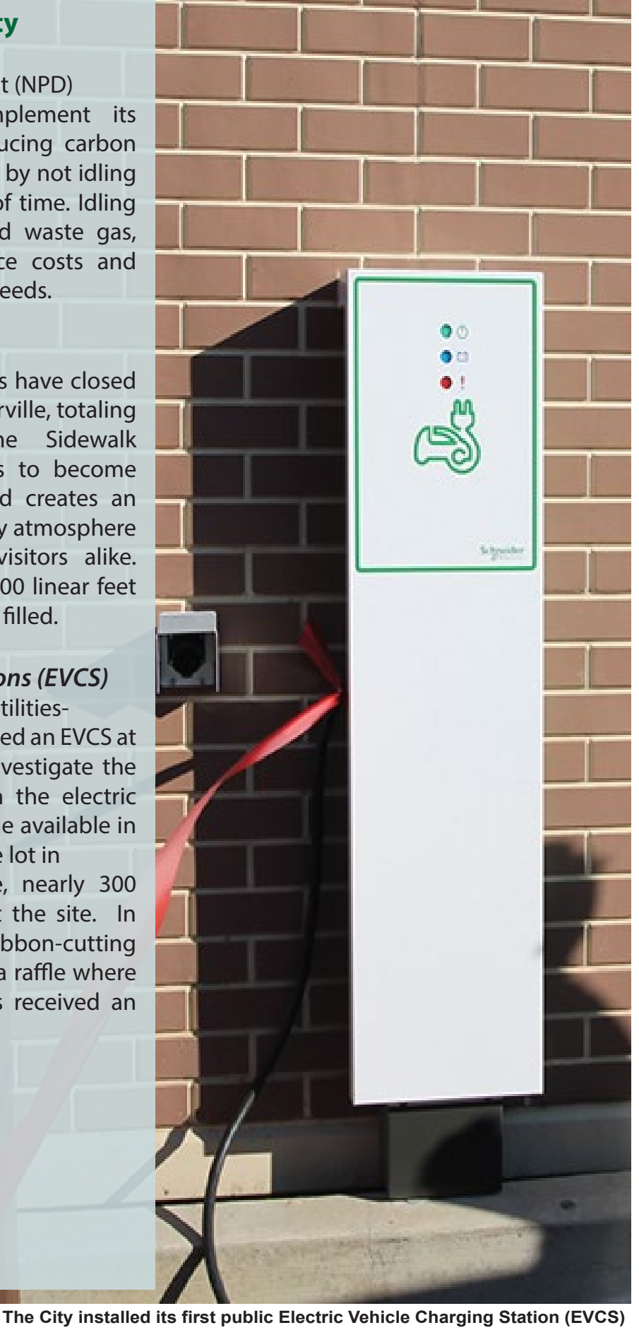
he City installed its first public Electric Vehicle Charging Station (EVCS) in the VanBuren Public Parking lot in downtown Naperville.

After the Department of Public Utilities-Electric (DPU-E) installed and tested an EVCS at the Electric Service Center to investigate the impact of charging stations on the electric grid, the first public EVCS became available in the downtown Van Buren surface lot in October 2012. Since that time, nearly 300 plug-ins have been recorded at the site. In conjunction with the NSGI, the ribbon-cutting event for this amenity included a raffle where five Naperville property owners received an EVCS for residential use.