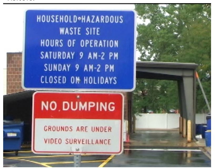
The HHW Recycling facility, located at Fire Station 4 on Brookdale Road

Naperville continues to offer one of only four permanent HHW collection locations in the state. In 2012, storage lockers were replaced to continue to safely provide this service to the region. In 2012, more than 260 tons of materials were collected from 15,890 visitors.