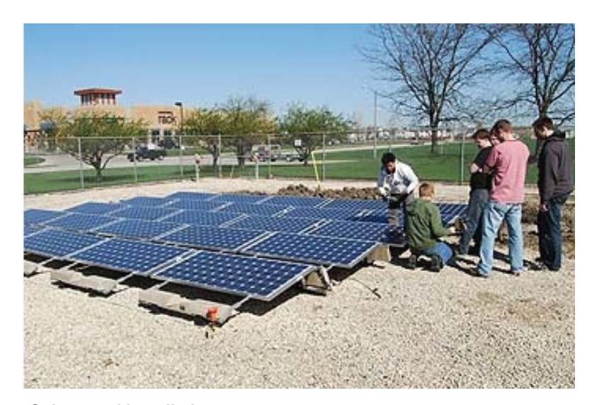
Solar panel installation

The Department of Public Utilities-Water (DPU-W) tested 25 percent of the pipe system with sonar technologies to detect and fix leaks. DPU-W tests 25 percent of the system each year as a proactive measure to maintain system efficiencies and save water resources.