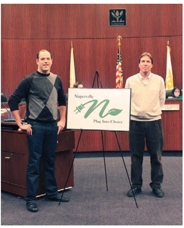
Winners of the NSGI logo contest in 2011

The Naperville Smart Grid Initiative (NSGI), lead by the Department of Public Utilities- Electric (DPU-E), is an investment in Naperville's City-owned utility using the latest digital to increase technology reliability, operating costs, improve efficiency and reduce waste for our customers. Installation of this infrastructure is consistent with Objective No. 14 contained in the Naperville Environmental Sustainability Plan. During the reporting period, the City continued with its extensive educational efforts and completed over 99 percent of the installation of approximately 58,000 meters serving customers across the City. In August of 2012, revamped utility bills started being sent to customers that allow additional energy usage information from future rate selections to be displayed on the bills. Extensive work to test the ePortal, a secure, and interactive website that will let customers learn more about their personal energy use, began in FY 13.