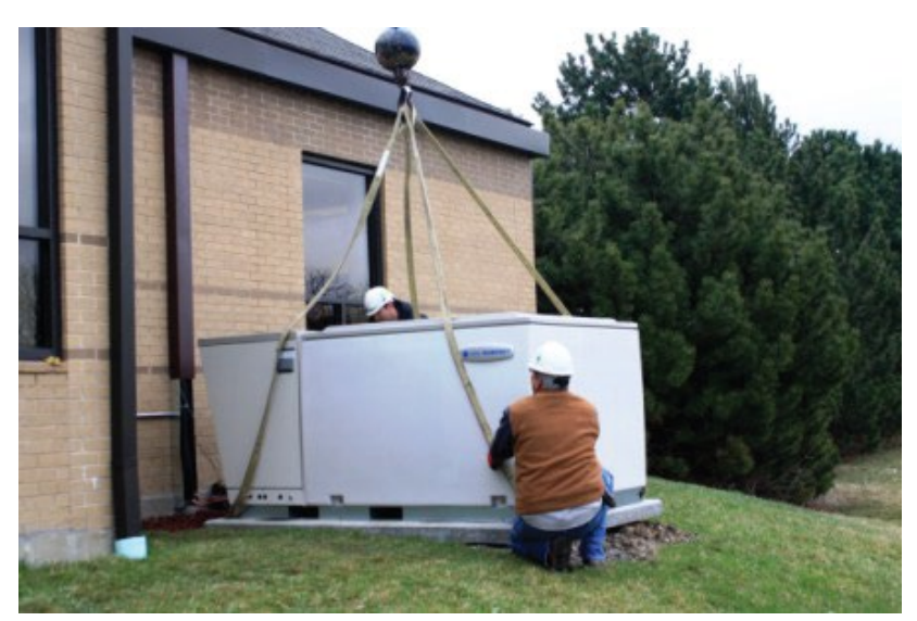
The "Ice Bear" installed in early spring 2013

In April 2013, as part of a public-private partnership, Verde Energy USA purchased and installed an Ice Energy "Ice Bear"™ air conditioning unit on the City of Naperville's Water Service Center, 1200 W. Ogden Avenue. The Ice Bear replaces a conventional condensing unit, a component of a typical building cooling system. Ice Bear shifts air conditioning electrical power demand to off-peak hours by using water to make ice at night, when the electric grid is generally unstressed. Then, during a hot summer day, when energy demand goes up and electrical prices may be higher, the melting ice provides the cooling that otherwise would have to come from the air conditioner compressor. The melting water is then recycled through the system when the process begins again the following night. The result is lower energy cost and increased electric grid reliability. The technology has proven effective in more than 50 investor and publically owned utilities across the country. Naperville's pilot partnership provides an opportunity for education and demonstration of the equipment to other municipalities, community facilities, and businesses.